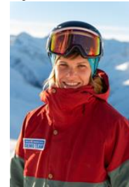
Head of Education Snowboard